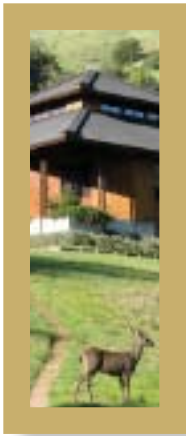
Spirit Rock Meditation Hall and Deer

The dew was still wet on the grass, but the sun was beginning to take the chill out of the morning air. Three deer grazed their breakfast on the hill beyond the Meditation Hall. At Spirit Rock, on the morning of October 17, 2011, about 350 friends, supporters, staff and teachers from Spirit Rock, as well as over fifty monastics from Theravada, Mahayana, and Vajrayana traditions gathered at the Meditation Hall to celebrate an historic event. On this auspicious day three Buddhist monastic women, samaneri, were about to be fully ordained as bhikkhunis in the Theravada tradition.