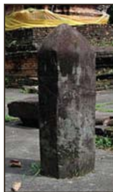
A Thai Sima Marker

In the center of the meditation hall a “sima” had been established. A sima is a boundary within which the monastic sangha's formal acts are performed in order to be valid. At a monastery, monastics will gather within the sima to recite the patimokkha, the basic rules and regulations of the order, or to hold sacred ceremonies such as ordinations. The sima boundary is delineated by sima markers. In Thailand they are often carved from stone.