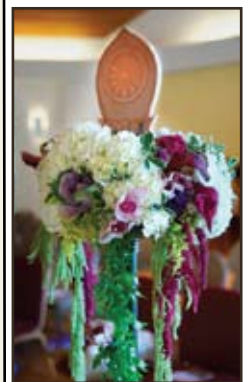
Flowered Bhikkhuni Ordination Sima Marker

When visiting a monastery in Northeast Thailand, I was shown the old moss and lichen-covered stone sima markers. I found myself wondering what the bhikkhuni sima markers would be like. My mouth fell open when I saw tall stands topped with bouquets of flowers and leaves cascading over the sides, holding the sima stones.