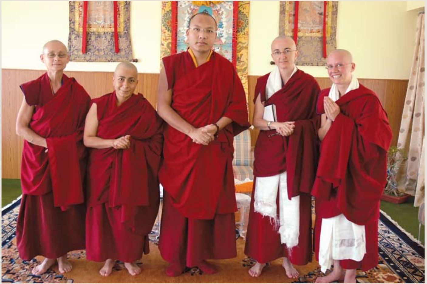
The Karmapa at his residence in northern India with members of the Dharmadatta Nuns' Community. The author is second from the right.